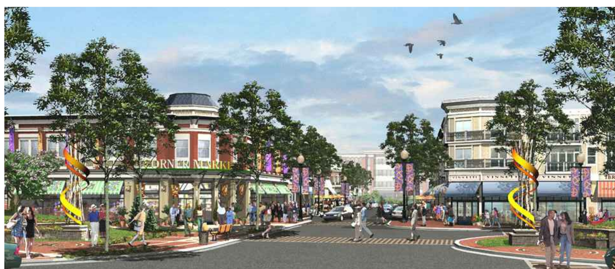
"WALKABLE SHOPPING CENTERS"