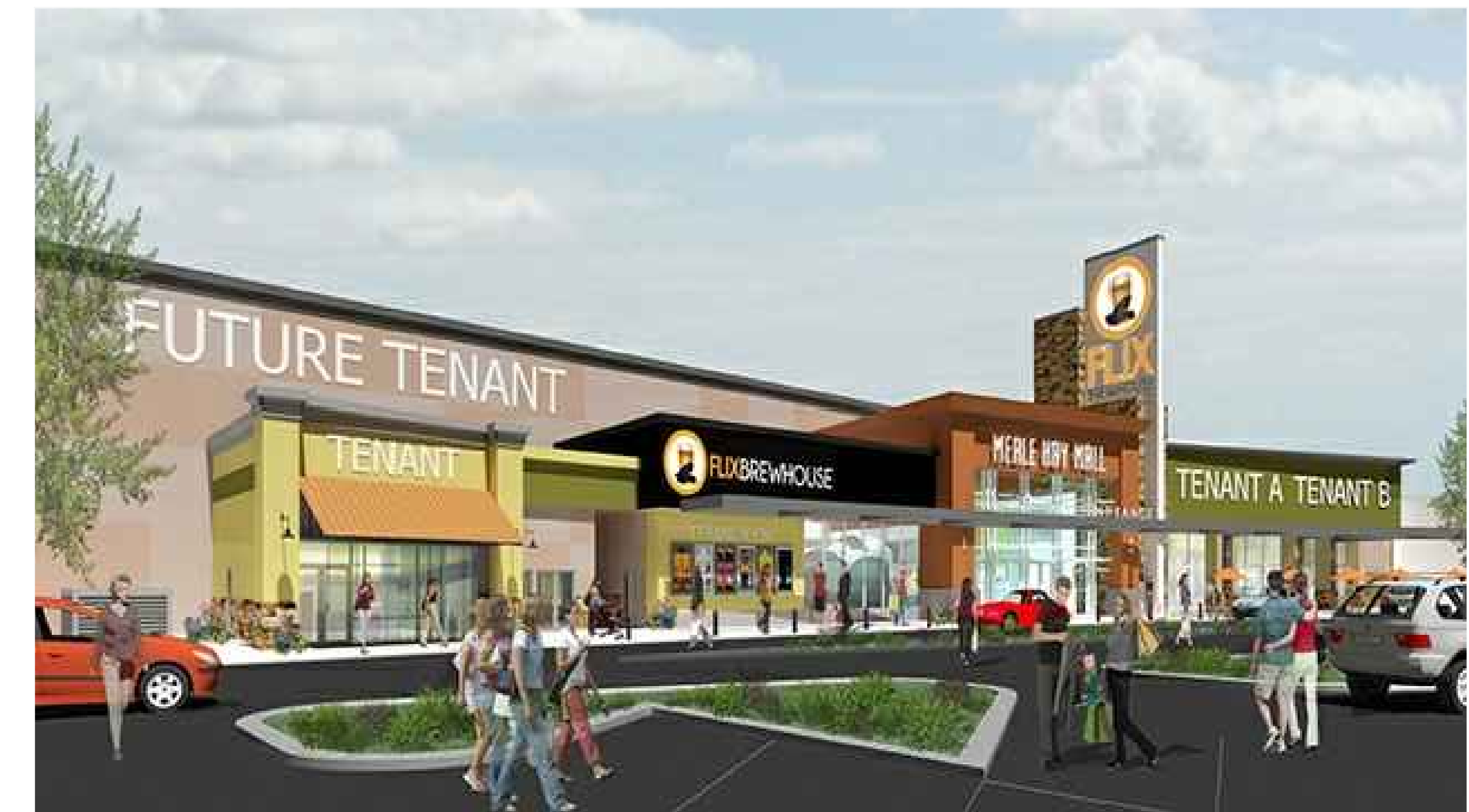
"STRIP MALL REJUVENATION"