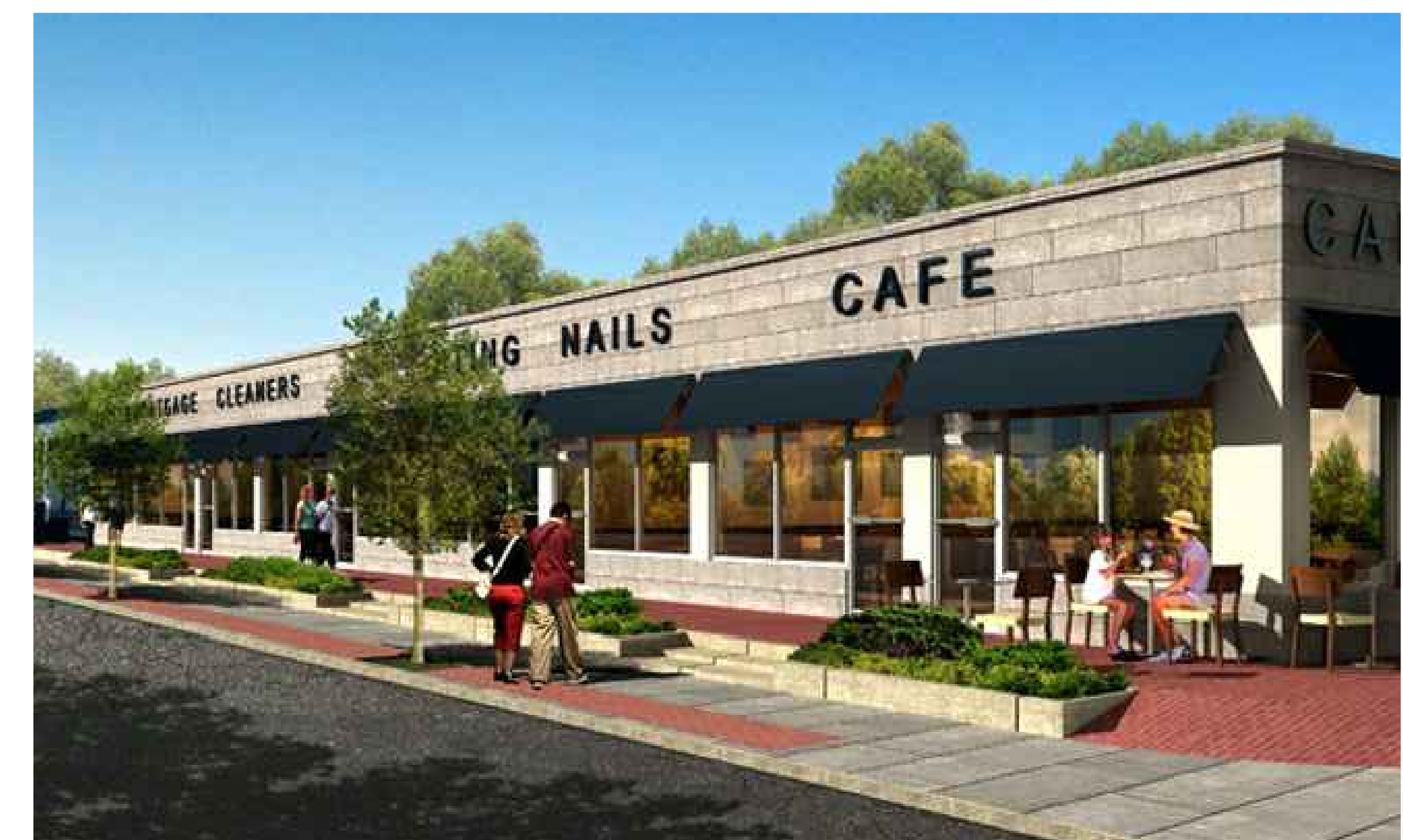
"SMALL AND LOCAL BUSINESS PLAZAS"